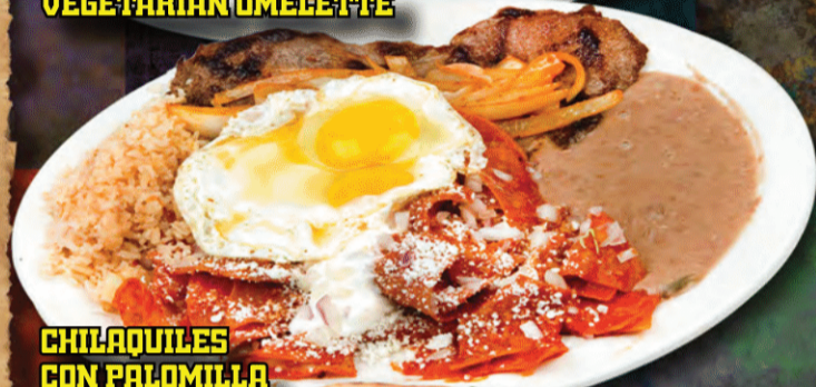
CHILAQUILES CON PALOMILLA