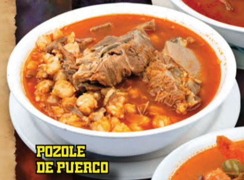
POZOLE DE PUERCO