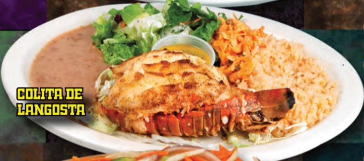
COLITA DE LANGOSTA