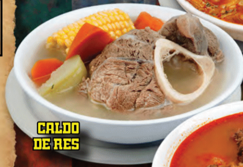
CALDO DE RES