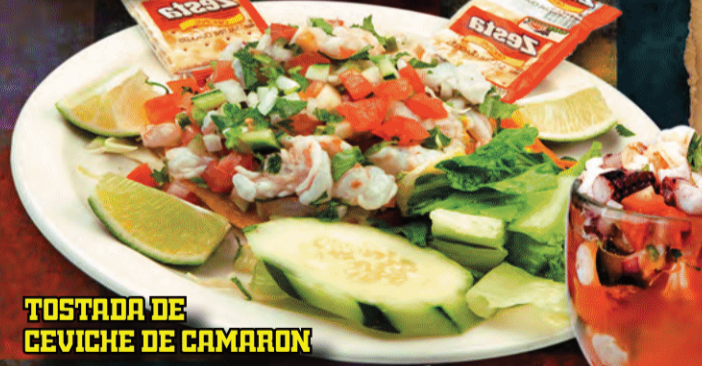
TOSTADA DE CEVICHE DE CAMARON