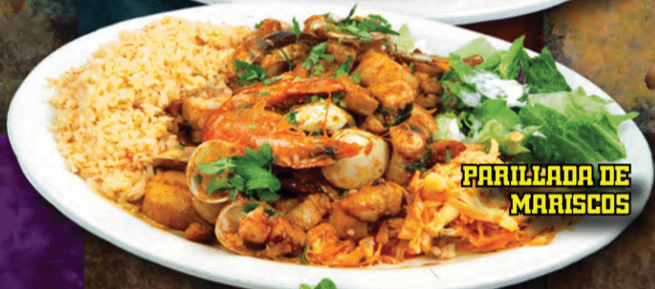
PARILLADA DE MARISCOS