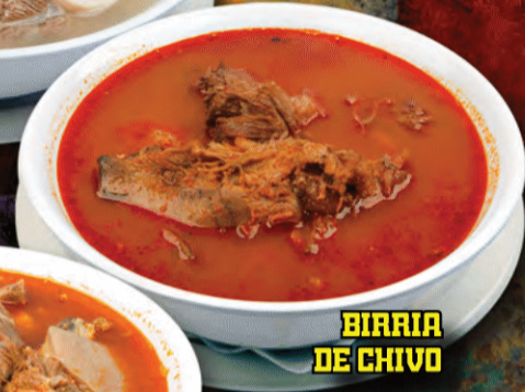
BIRRIA DE CHIVO