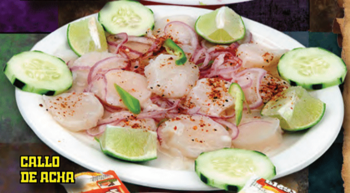
CALLO DE ACHA