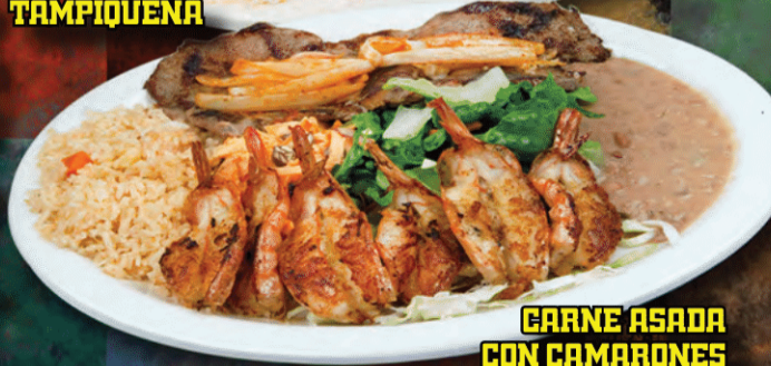
CARNE ASADA CON CAMARONES

Warning: Eating these oysters may cause severe illness and even death in persons who have liver disease (For example, Alcoholic Cirrhosis), cancer or other chronic illnesses that weaken the immune system. If you eat raw oysters and become ill, seek immediate medical attention. If you are unsure if you are at risk, you should consult your physician. Aviso Importante: Comer estas ostras crudas pueden causar una enfermedad grave y hasta la muerte en las personas que padecen de enfermedades del hígado (por ejemplo, cirrosis alcohólica), cáncer u otras enfermedades crónicas que debilitan el sistema inmunológico. Si usted come ostras crudas y se enferma, debe buscar atención médica inmediatamente. Si usted cree estar en peligro, debe consultar un médico.